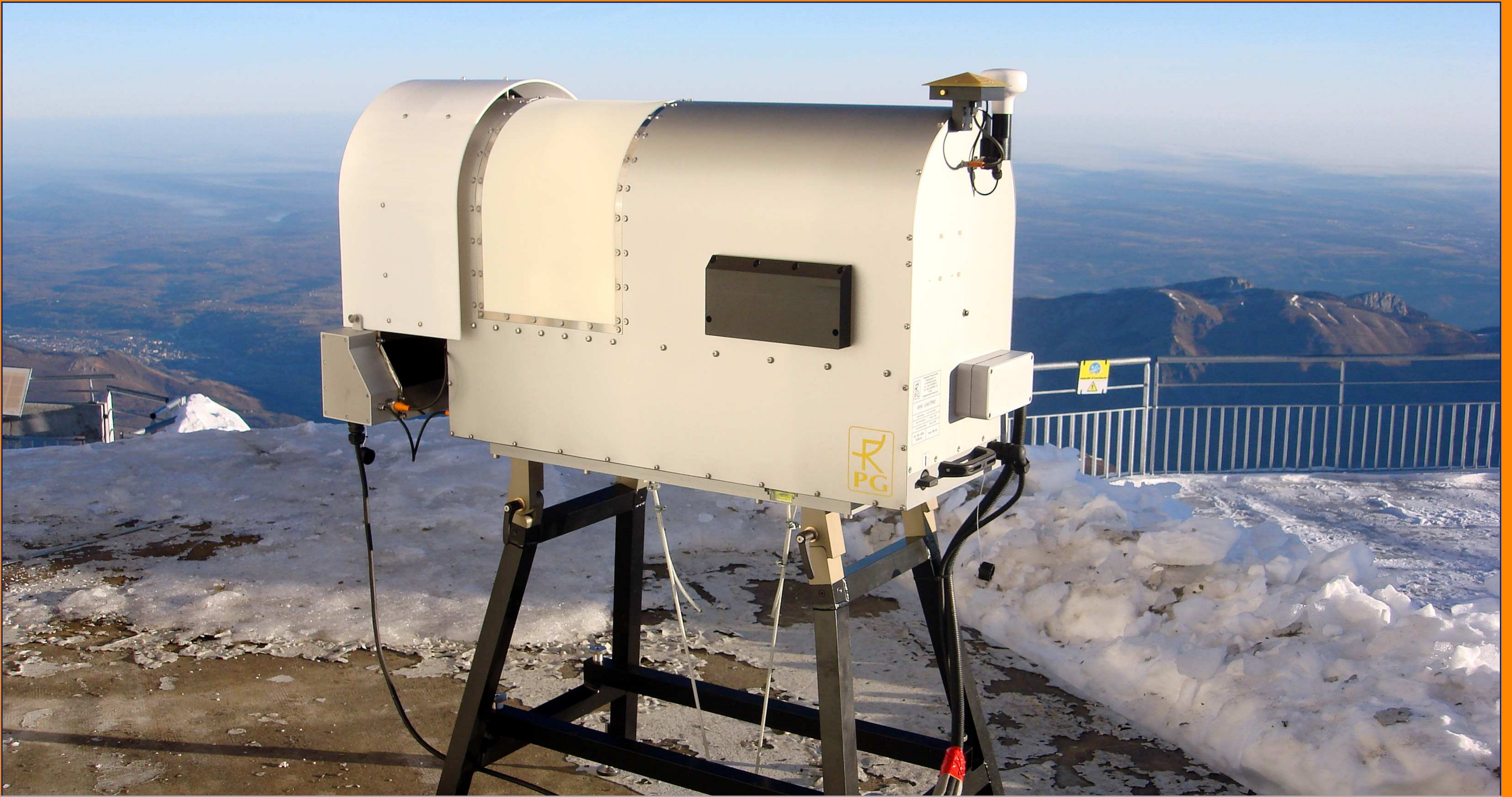
LHATPRO (50+183 GHz), Pic du Midi, France (Later: Dome-C, Antarctica)